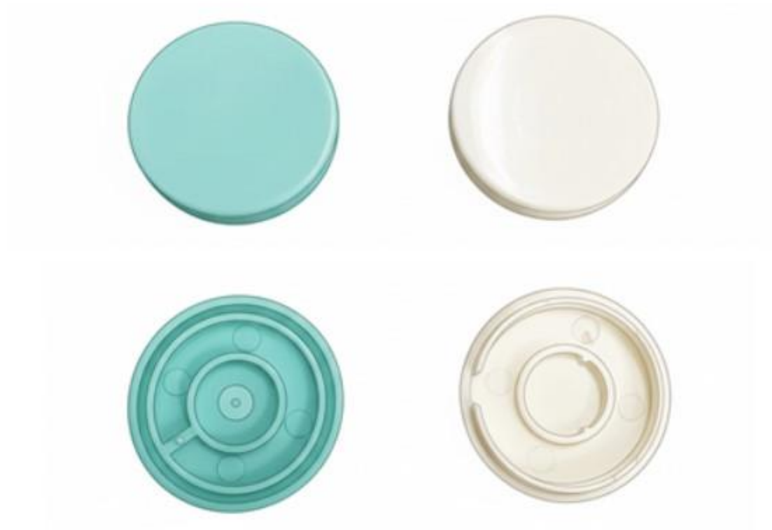
View from above