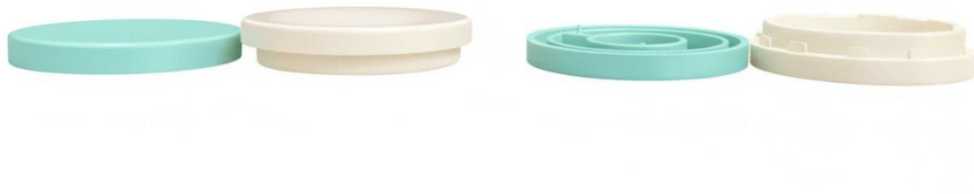
Viewed from side

Take each piece one by one and check them by lightly pinching or touching them with your fingers.