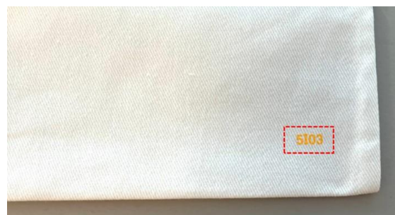
Drawstring bag for storing spinning tops